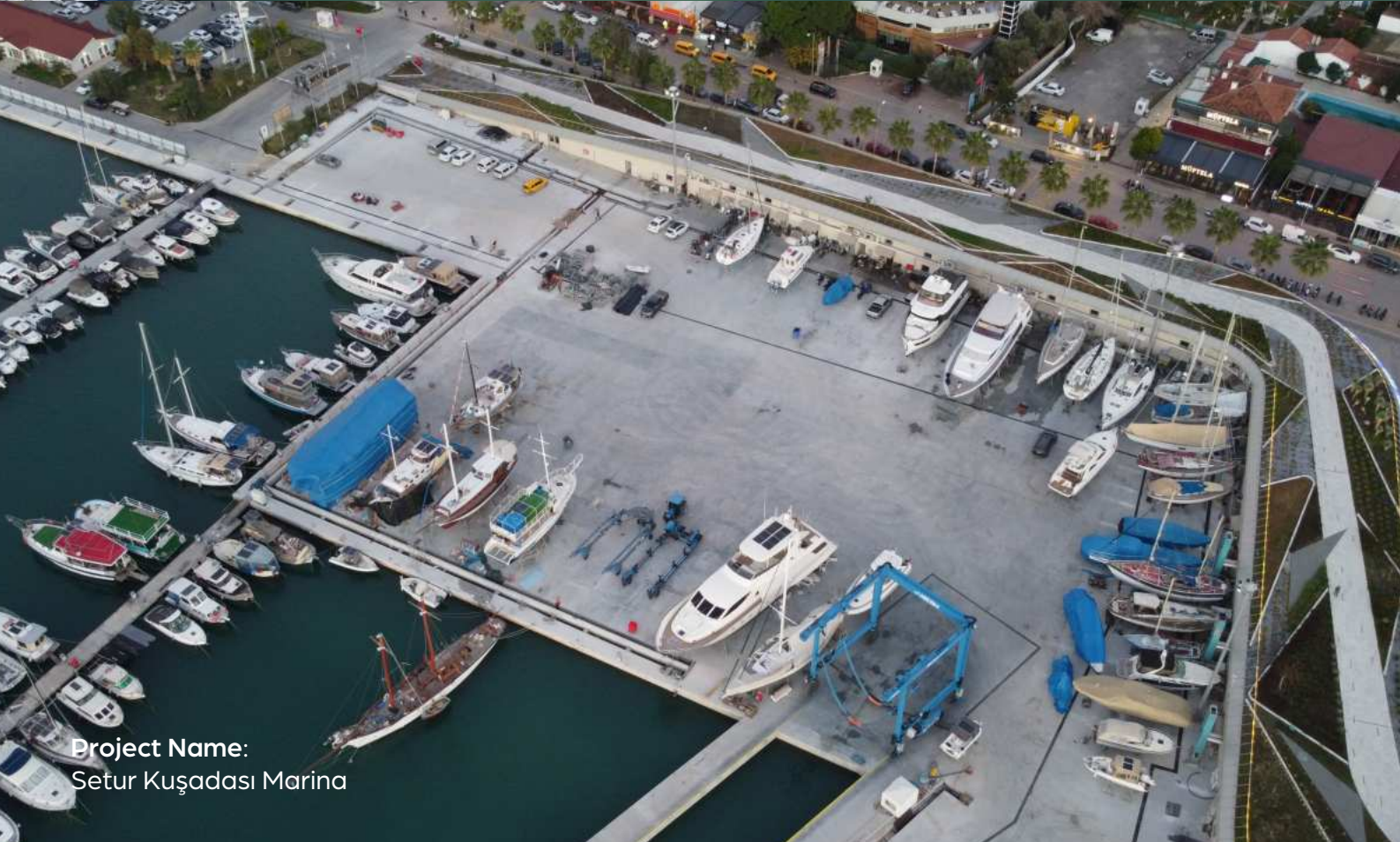
Project Name: Setur Kuşadası Marina