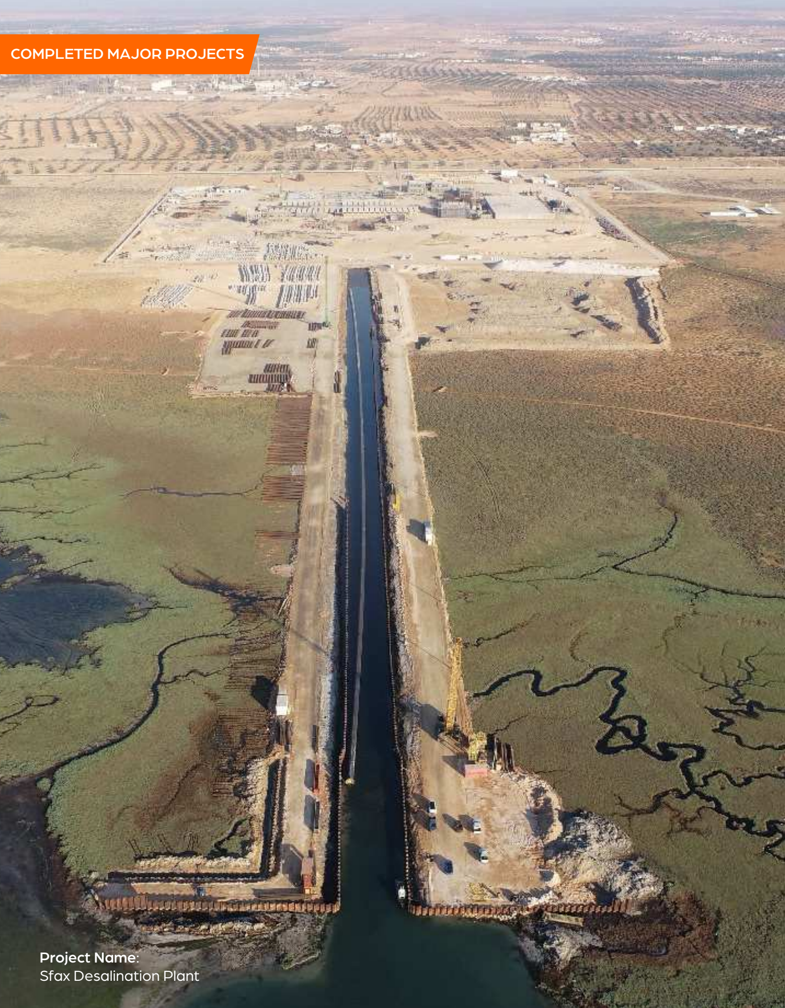
Project Name: Sfax Desalination Plant