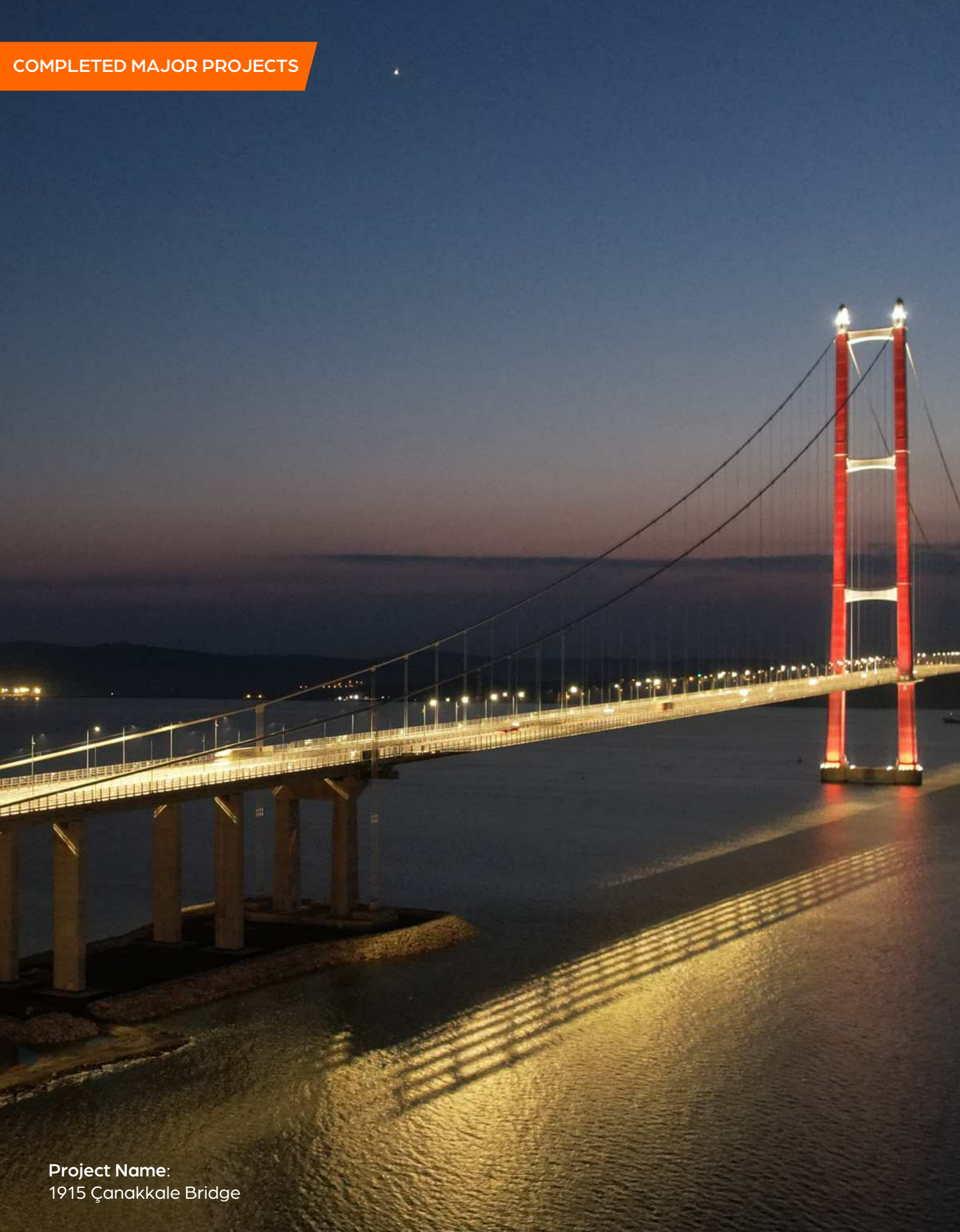
Project Name: 1915 Çanakkale Bridge