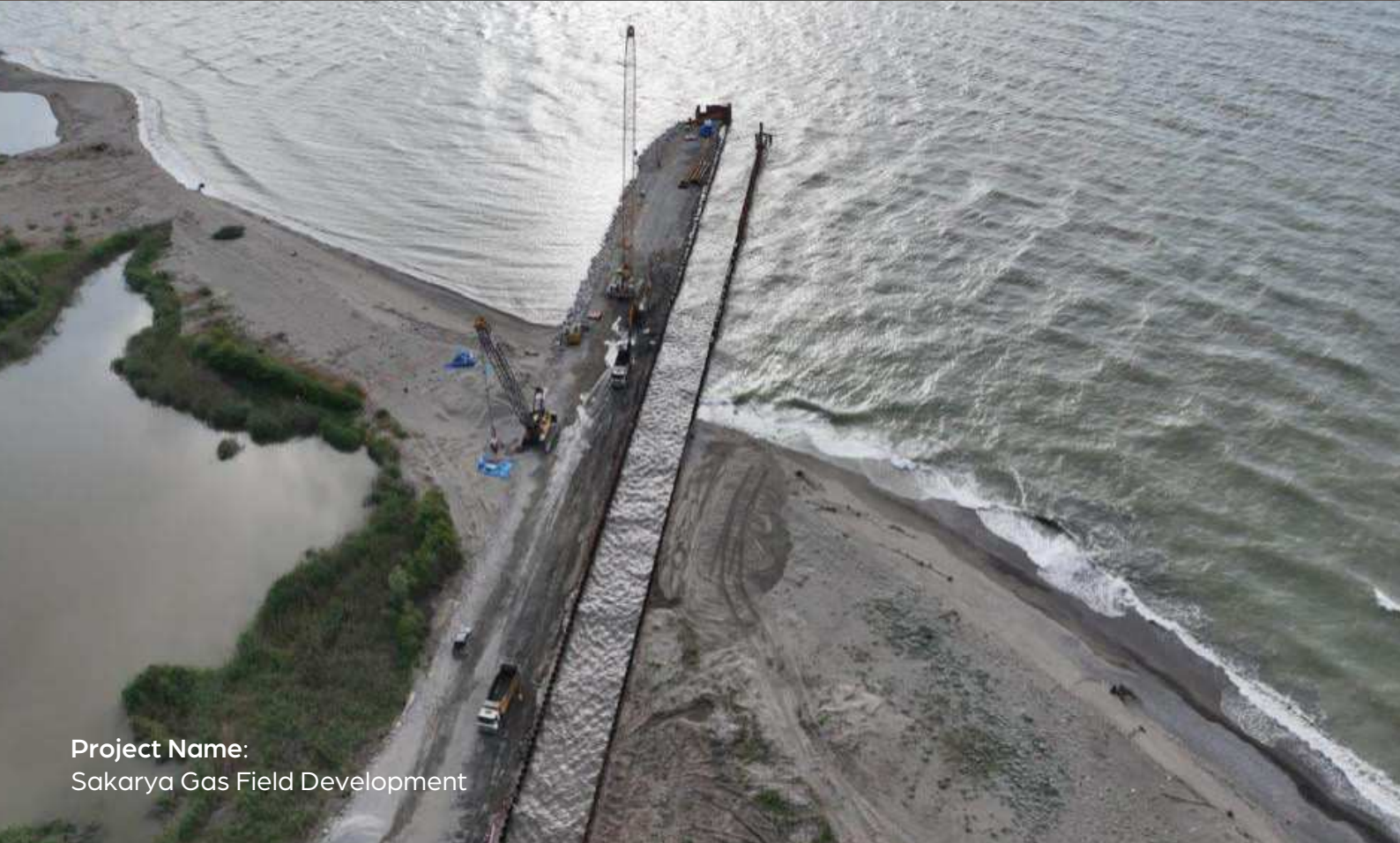
Project Name: Sakarya Gas Field Development